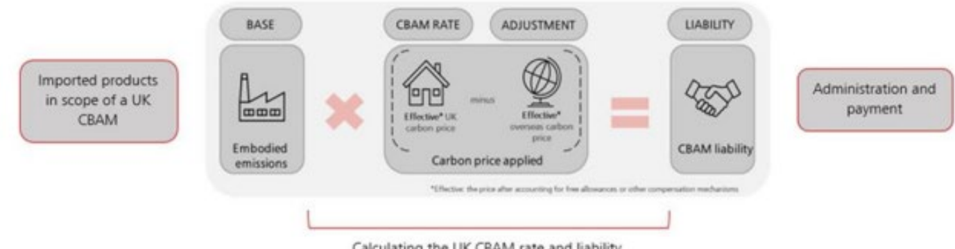
Calculating the UK CBAM rate and liability